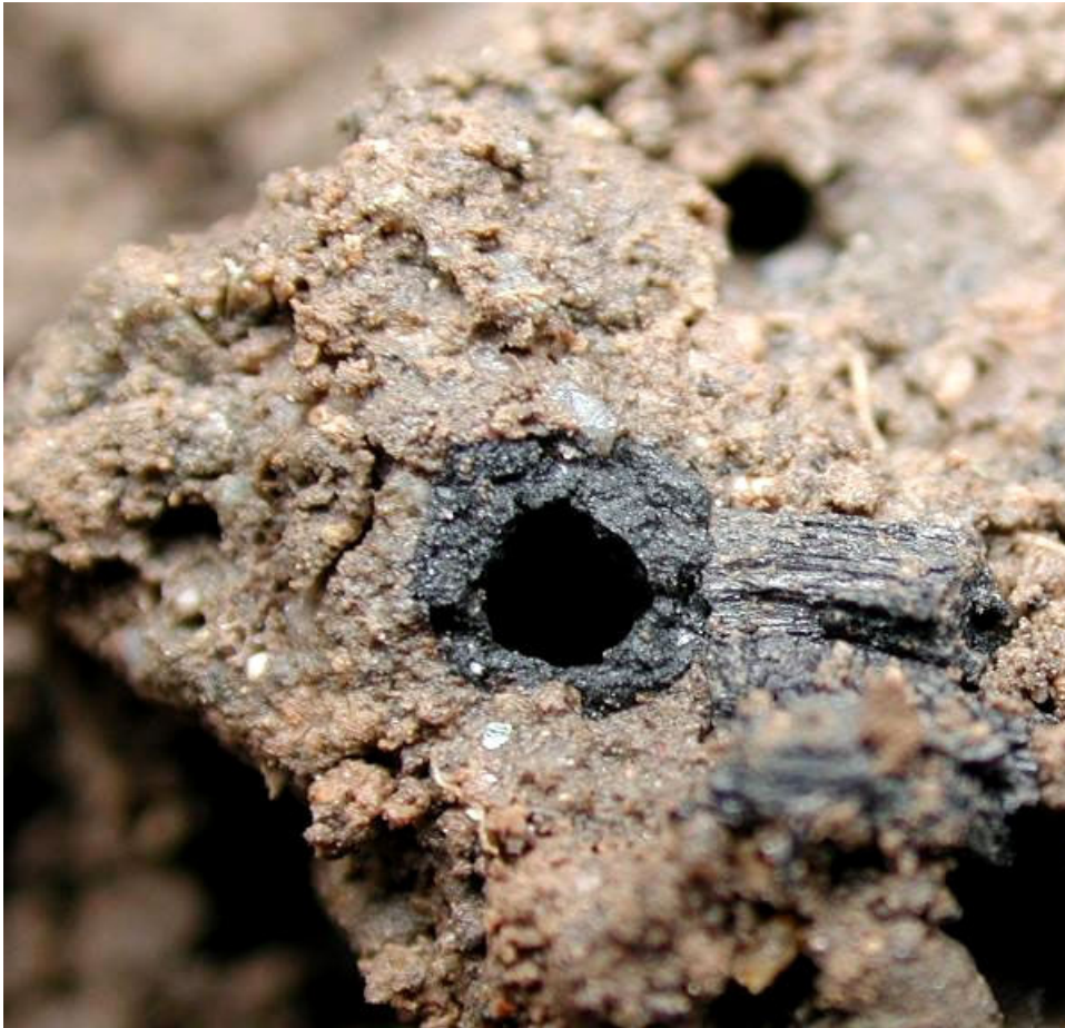
Soil from a vegetable patch with biochar compost (about 25 cm deep). An earthworm has lined its path with biochar-containing solution. By the way, earthworms: many laboratory tests have shown that these animals are a great lover of biochar substrates. Diameter about 4 mm.

The following are four systems of procedures which are examples of the practical implementation of biochar activation for agriculturally related quantities. All procedures can also be adapted for a small garden and even a balcony: