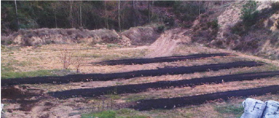
Activating biochar through Method 2 in the winery Pago Casa Gran, southern Spain.