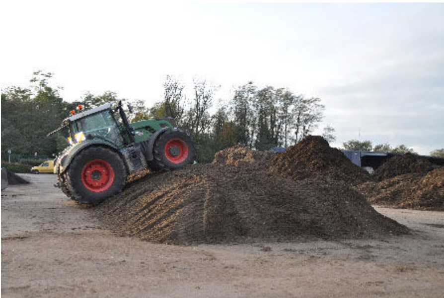
Compressing a biochar-manure mixture before covering it with an airtight foil. Bokashi fermentation is an anaerobic process.