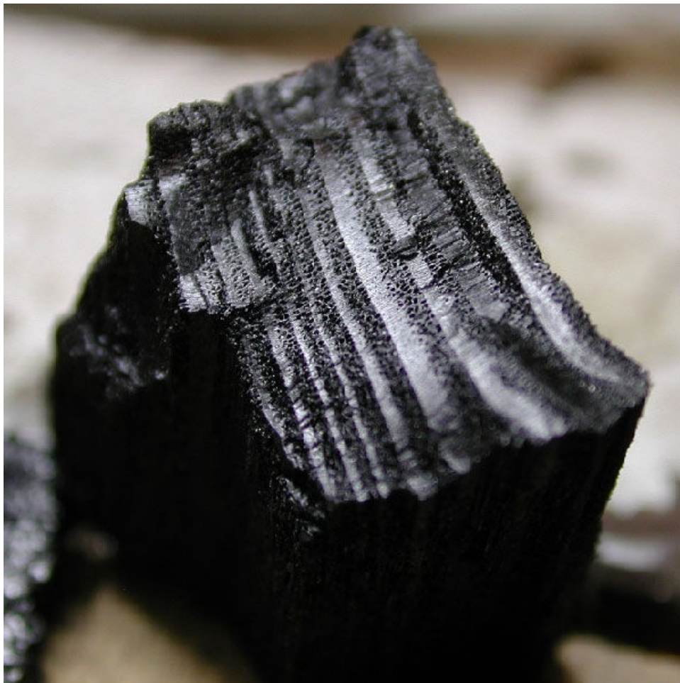
Porosity of a coal ash also clearly visible to the naked eye.

Biochar is extremely porous and has a huge surface area of partly 300 m 2 per gram. Due to its high porosity, biochar can take up water including the dissolved nutrients of up to five times its own weight. This property is called adsorption capacity (AC) of biochar, which depends on the pyrolyzed biomass and the pyrolysis temperature. Biochar's highest adsorption capacity is achieved within the temperature range of 450 ° C to 700 ° C.